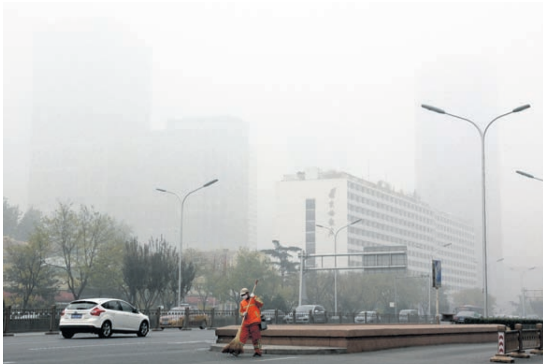
In this Nov. 14, 2018, file photo, a cleaner wearing a mask against pollution sweeps a street in Beijing.

But with life and heat-trapping gas levels inching back toward normal, the brief pollution break will likely be "a drop in the ocean" when it comes to climate change, scientists said. In their study of carbon dioxide emissions during the coronavirus pandemic, an international team of scientists calculated that pollution levels are heading back up — and for the year will end up between 4% and 7% lower than 2019 levels. That's still the biggest annual drop in carbon emissions since World War II. It'll be 7% if the strictest lockdown rules remain all year long across much of the globe, 4% if they are lifted soon. For a week in April, the United States cut its carbon dioxide levels by about one-third. China, the world's biggest emitter of heat-trapping gases, sliced its carbon pollution by nearly a quarter in February, according to a study Tuesday in the journal Nature Climate Change . India and Europe cut emissions by 26% and 27% respectively. The biggest global drop was from April 4 through 9